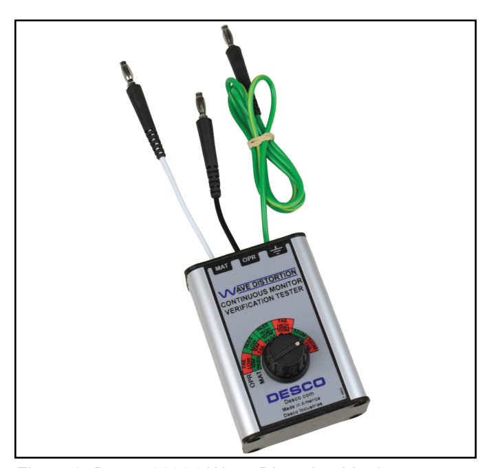
Figure 9. Desco <u>98221</u> Wave Distortion Monitor Verification Tester