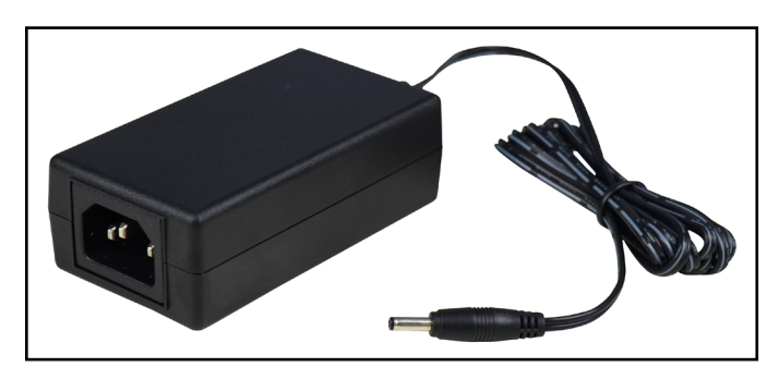
Figure 3. Universal power adapter included with the 19243 Mini Monitor

NOTE: The power cord must be purchased separately if ordering the 19243 Mini Monitor. The power cords are available as the following item numbers: