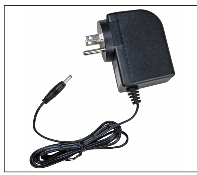
Figure 2. North American power adapter included with the 19239 and 19242 Mini Monitors