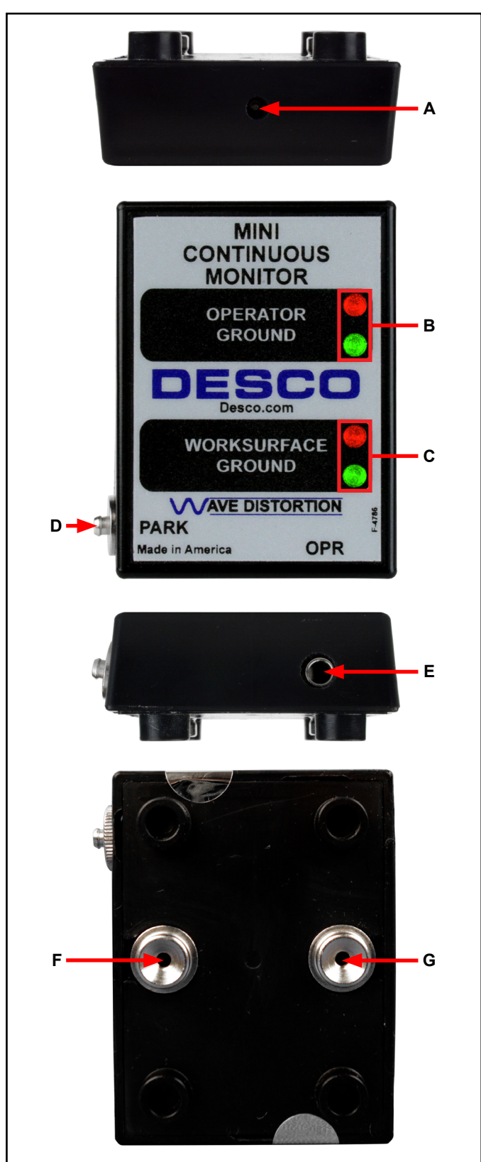
Figure 4. Mini Monitor features and components