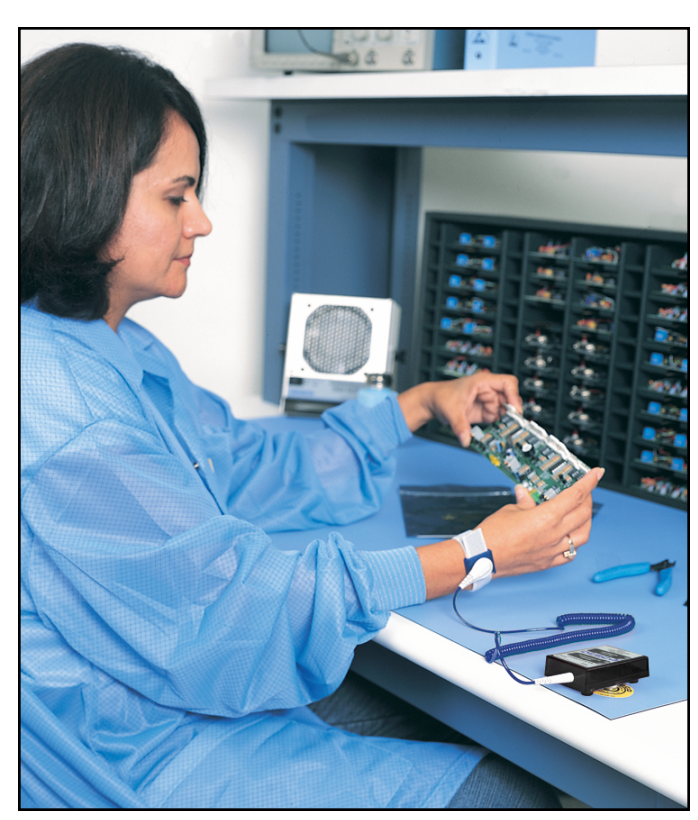
Figure 8. Using the Mini Monitor