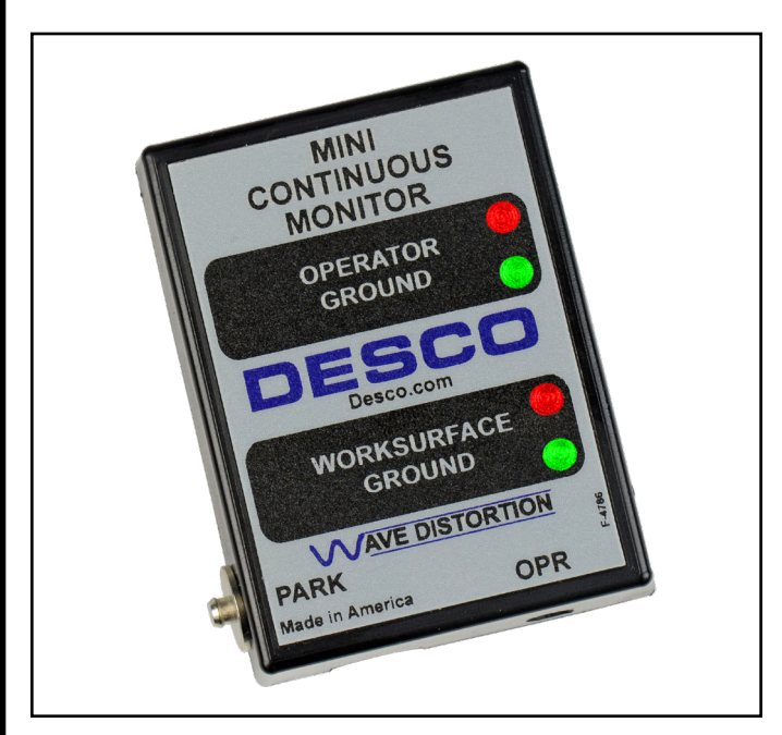
Figure 1. Desco Mini Monitor