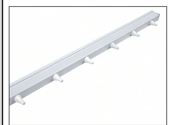
Figure 1. EMIT Air Assisted Ion Bar