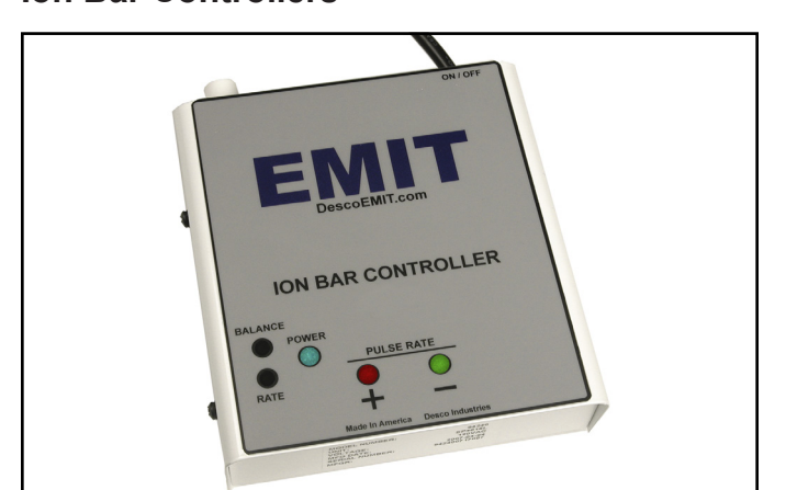
Figure 4. EMIT 50940 Controller with Recessed Potentiometer Adjustment