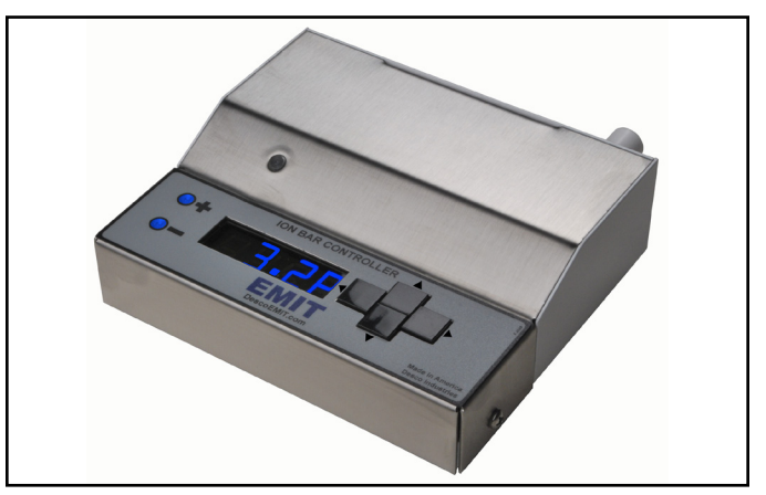
Figure 6. EMIT 50855 Controller with Digital Adjustment