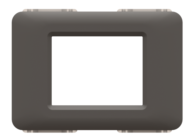
Bare 2.4" Bezel with clips attached - Front

Bezels are available in Black only as standard, however, can be ordered in White on special request, subject to MOQs. Please contact Sales.